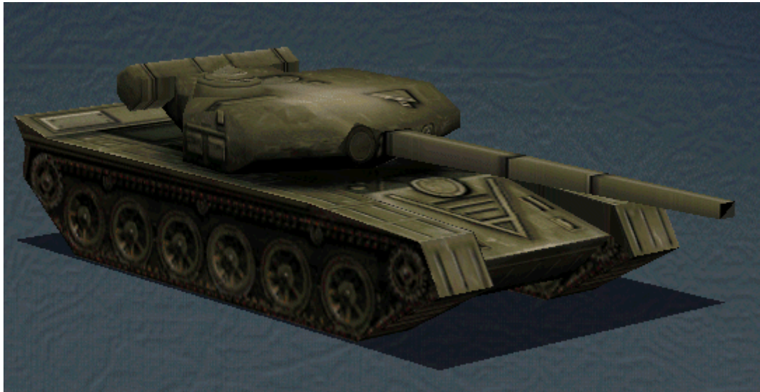
A T-80 Main Battle Tank (archive photograph)

Our best intelligence suggests the Russian tanks are the T-80 type which is an extremely capable MBT, and is very well protected against land-based anti-tank weapons. If this is indeed the case, destroying as many as possible will prove to be even more vital to the success of the 1417th in stopping it altogether.